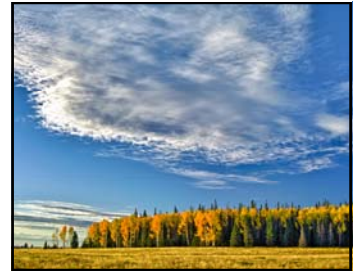
A back road find in the Boulder Mountain region