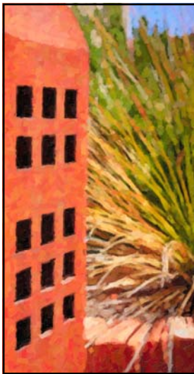
Hidden in Kayenta

This past summer I made an offer to my alumni (and current) students to meet with me for an hour for evaluation and advice. If I recall, about 20 folks participated. We did this in small groups. I do this during non-teaching days since that is when I have the time available.